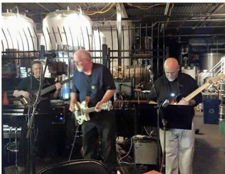
Bent Brewstillery Roseville MN