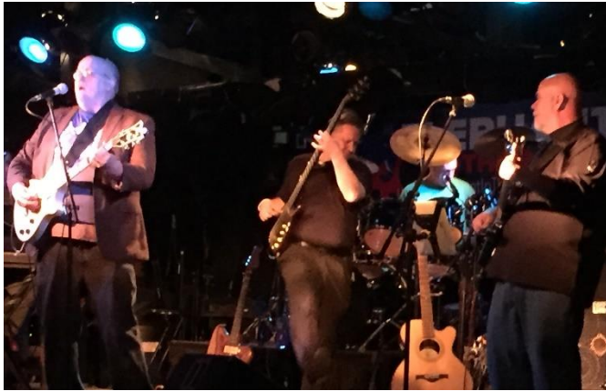
O'Garas Saint Paul MN