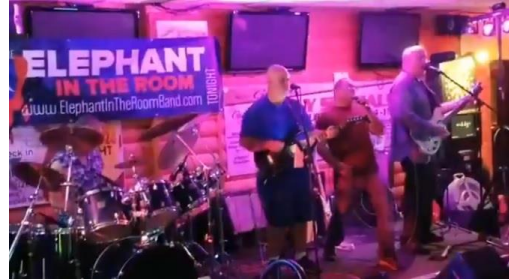
The Outpost Ramsey MN