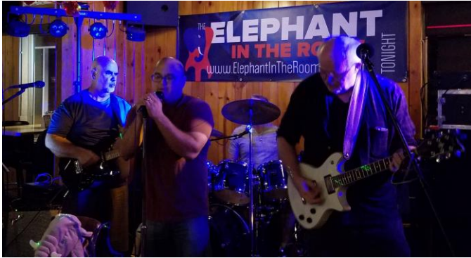
Stillwater Eagles 94 Stillwater MN