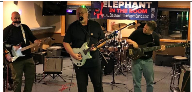
Sundance Golf Club Maple Grove MN