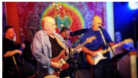
Driftwood Char Bar Minneapolis MN